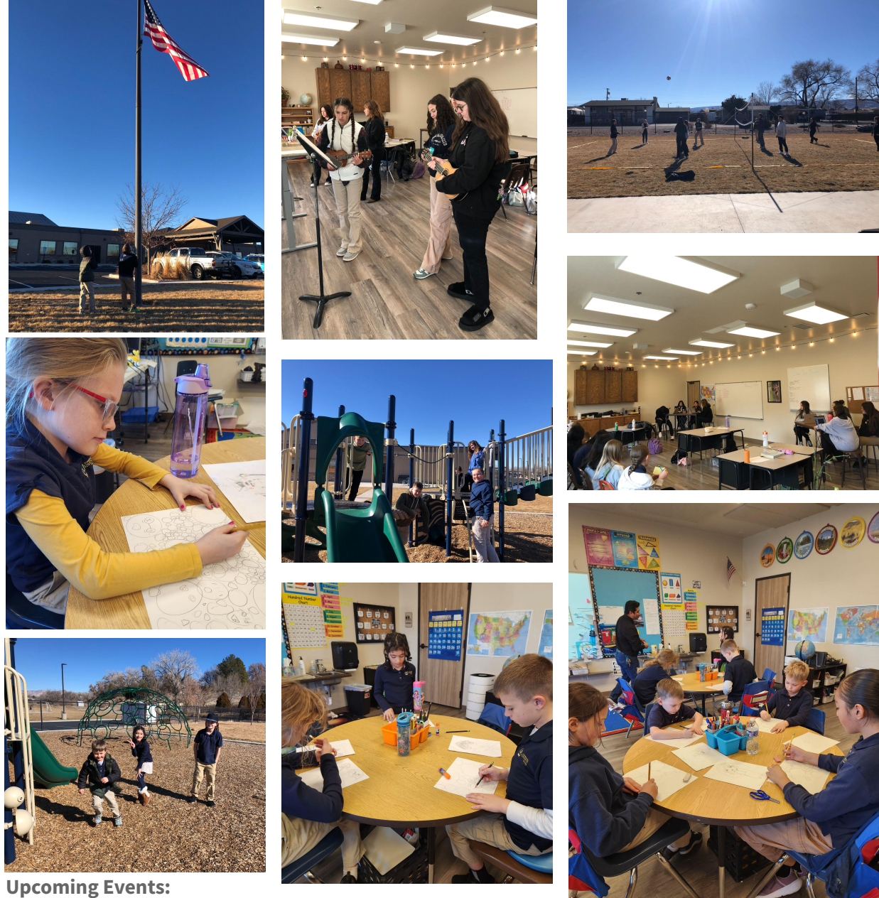
Upcoming Events: February 8: Ski Day February 19: President's Day- No School